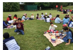
Red, White & Blue Day: Thurs 26 th May 2022

Includes all school staff – caretakers, managers, governors, volunteers, agency workers