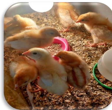
Pictured above: Day 7